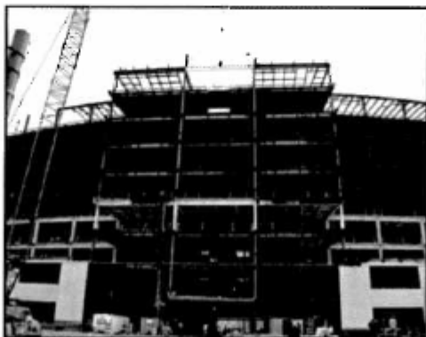
Raising the beam