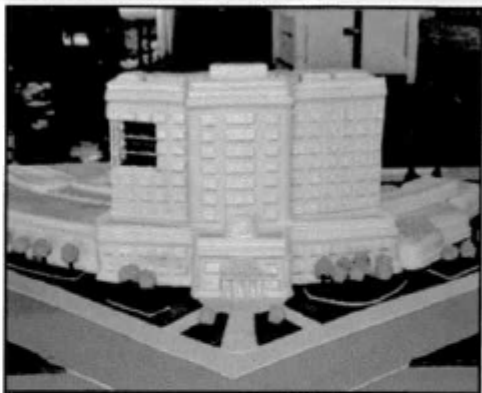
A cake replica of the Juvenile Justice Center

The Scandinavian custom began over 1,000 years ago when, after the Vikings completed building their homes, they hoisted an evergreen tree to celebrate.